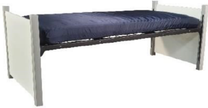
*Unit shown in Urban Gray finish on posts with white melamine panels.